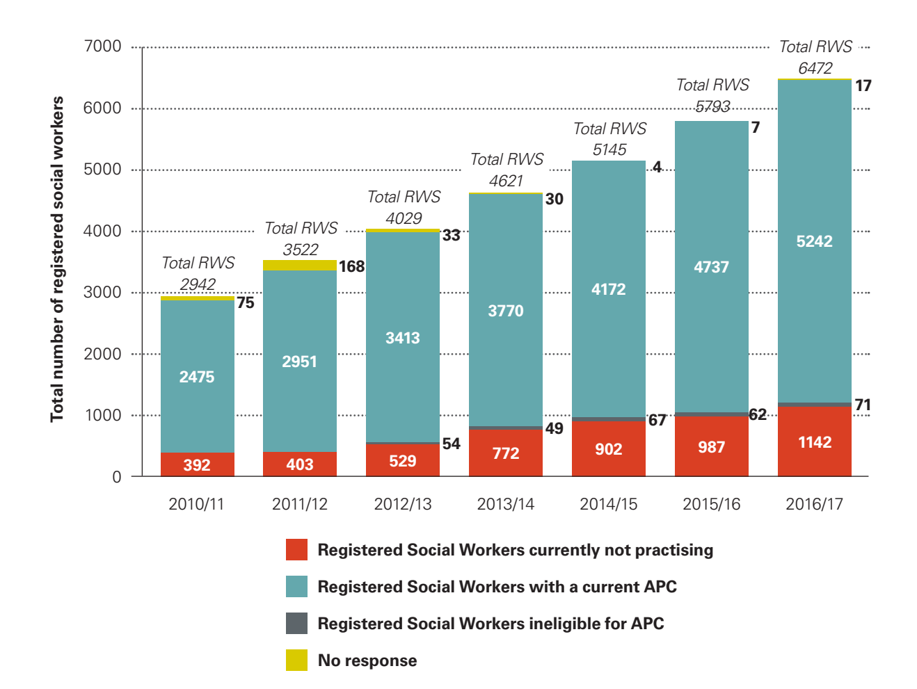
Figure 2: Total Registrations compared with Total APCs issued 2010 – 2017<sup>15</sup>